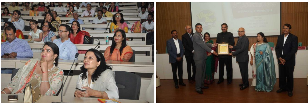
Third Alumni Meet