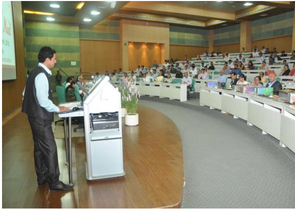
Second Alumni Meet