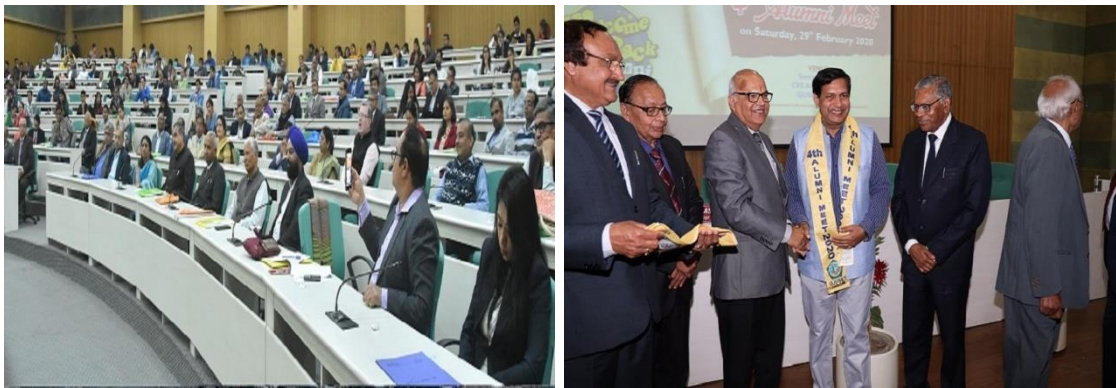
Fourth Alumni Meet

Aim of the alumni meet at GJUS&T and HSB is to foster a sense of community among alumni, faculty and present students of the university. It inculcates a sense of connectedness with the institution. Alumni meet helps the alumni exchange information about their work, experiences and help each other with networking needs such as hiring, referrals for specific expertise, or looking for a new job.