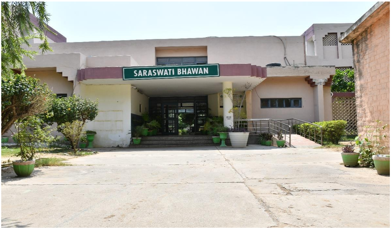
Saraswati Bhawan (Girls Hostel-II)