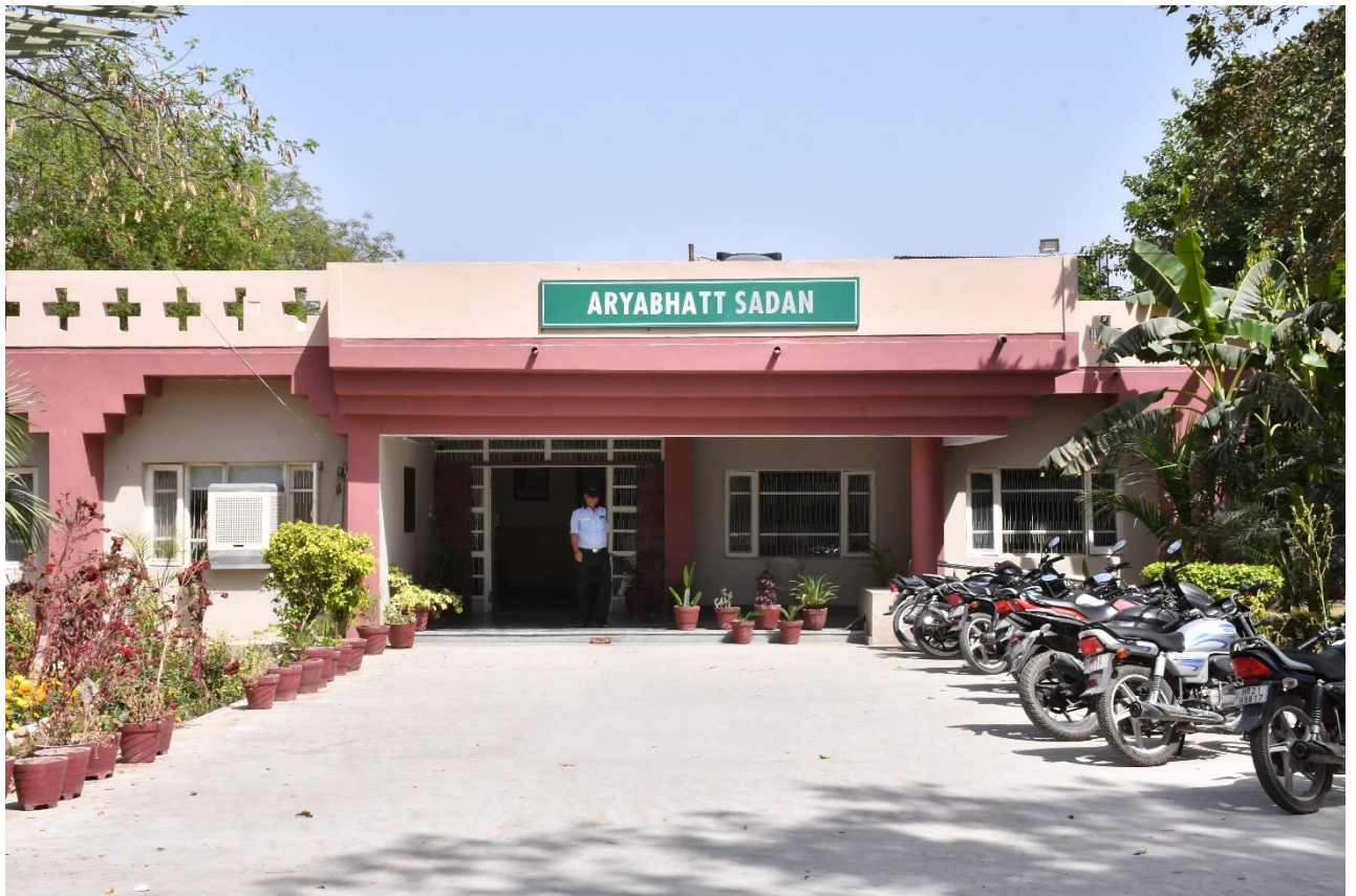
Aryabhata Sadan (Boys Hostel-II)