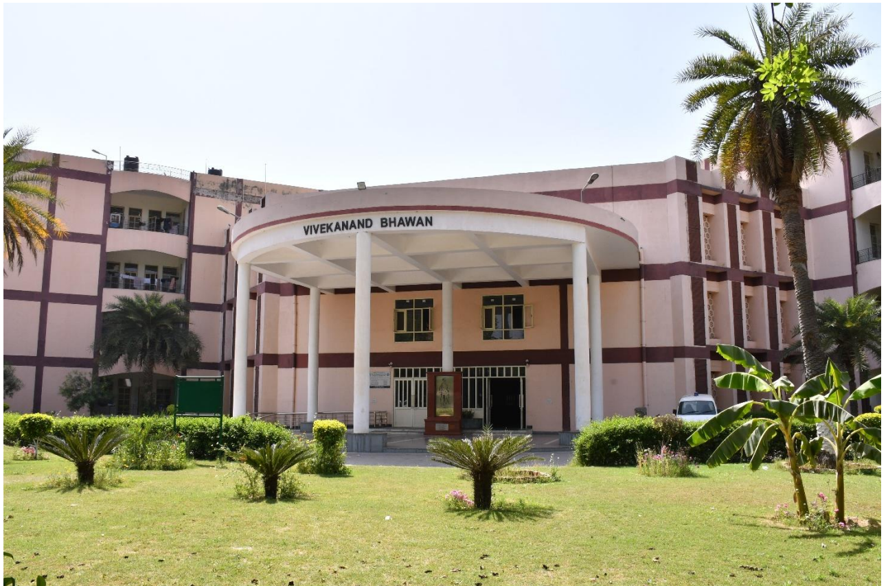
Vivekanand Bhawan (Boys Hostel-IV)