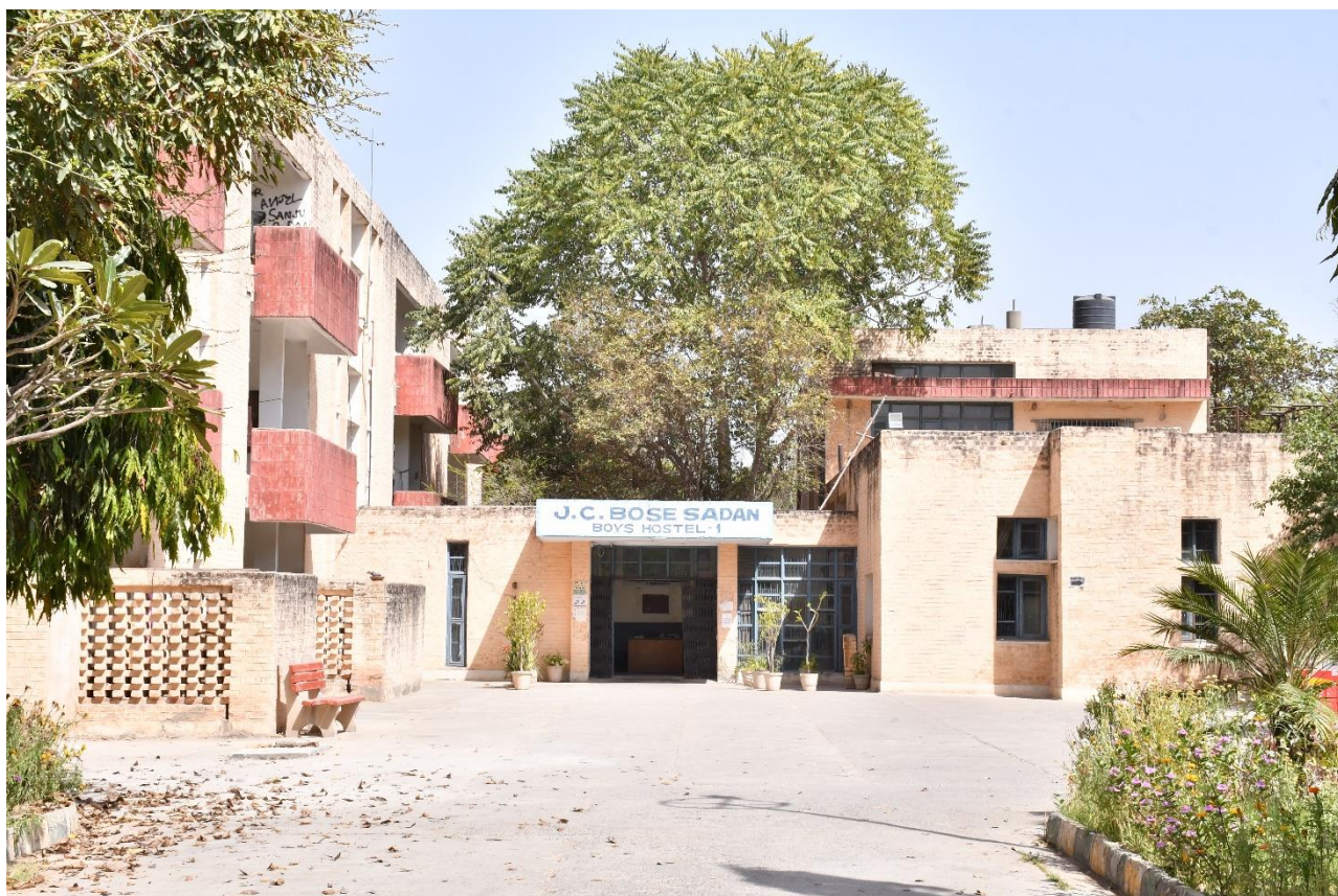
J.C. Bose Sadan (Boys Hostel-I)

The meal is provided as per healthy & balanced menu at reasonable rates and menu items & quality check is done randomly by the Mess Committees, Wardens, Coordinators, Deputy Chief Wardens and the Chief Wardens. Hostel accommodation will be provided according to latest Govt. COVID-19 guidelines and hostel rules. The prospective hostellers are also required to submit medical fitness certificate at the time of admission. The hostel residents are governed by the terms and conditions as contained in the University Hostel Regulations. The university administration with the very energetic and dedicated team of hostel administrations ensures a better quality of life for all the hostel residents.