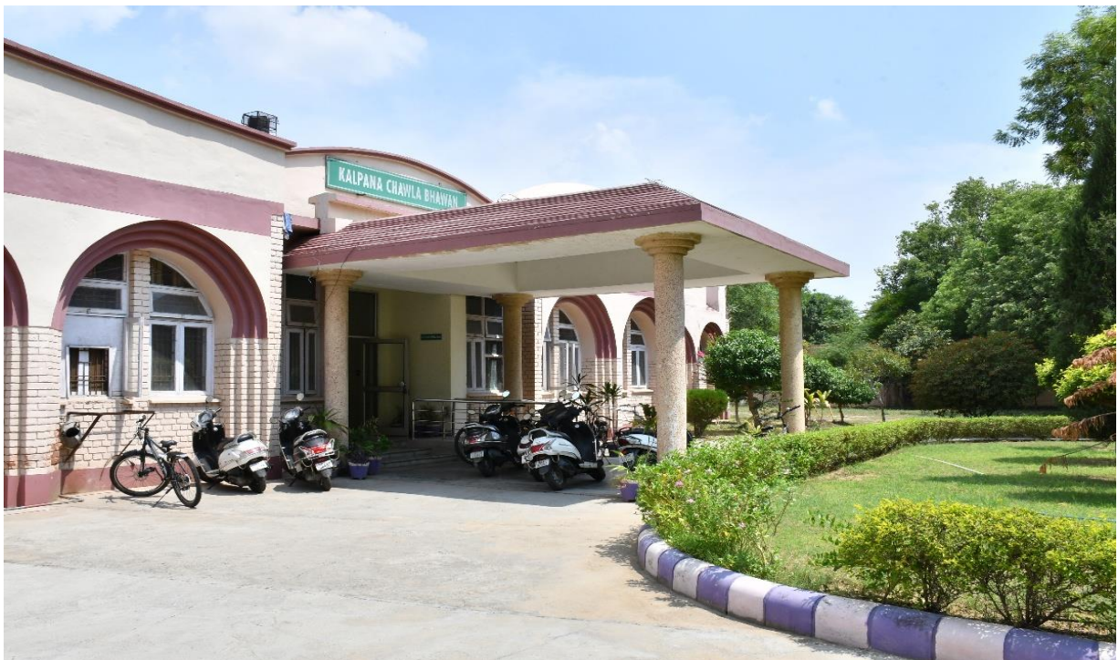
Kalpana Chawla Bhawan (Working Women Hostel)