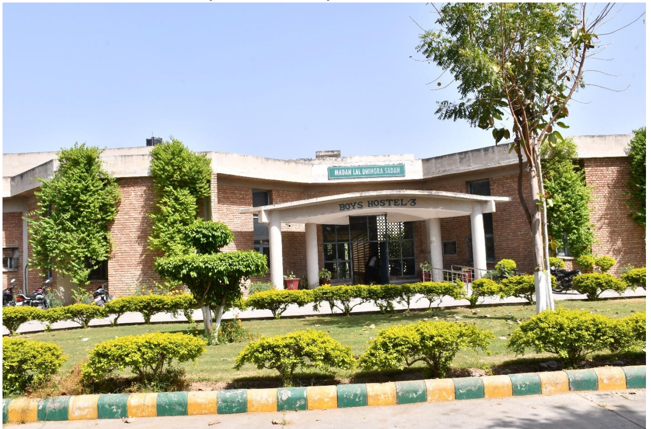
Madan Lal Dhingra Sadan (Boys Hostel-III)