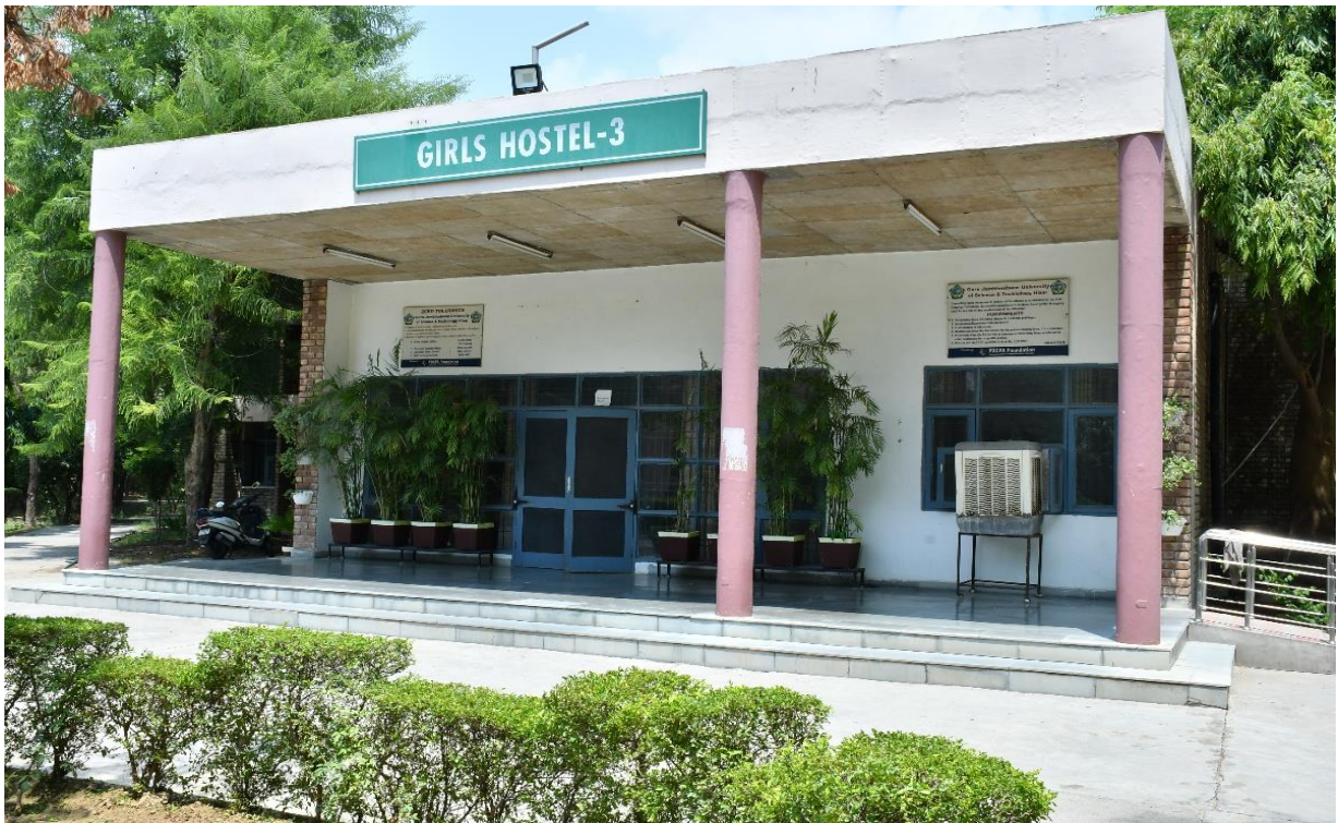
Manikarnika Bhawan (Girls Hostel-III)