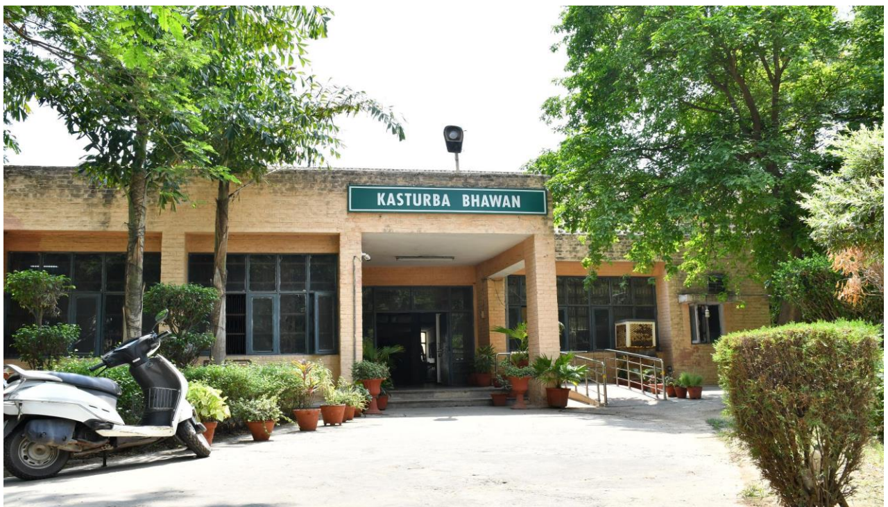
KASTURBA Bhawan (Girls Hostel-I)