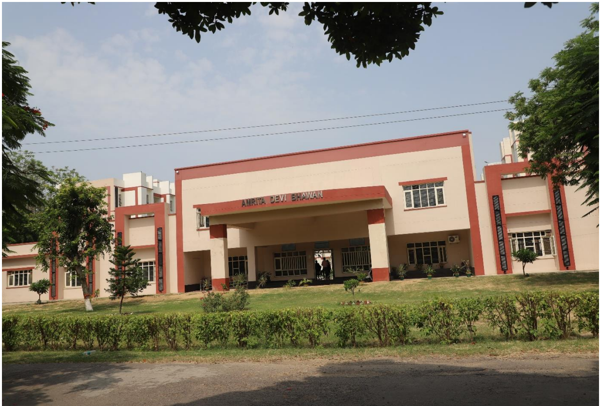
Amrita Devi Bhawan (Girls Hostel –IV)